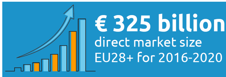
Figure 1 Economic Benefits of reusing Open Data 2

Open, Data has been identified as a fundamental resource for governments, businesses and civil society. For 2016, the direct market size of Open Data is expected to be 55.3 bn EUR for the EU 28+. Between 2016 and 2020, the market size increases by 36.9%, to a value of 75.7 bn EUR in 2020, including inflation corrections. For the period 2016-2020, the cumulative direct market size is estimated at 325 bn EUR. 1